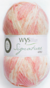
English Rose 806