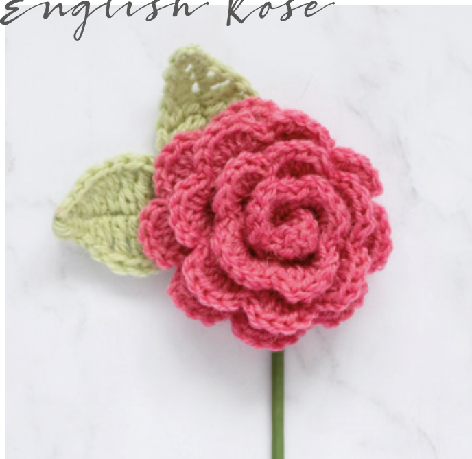
Crocheted in Honeysuckle 234 and Hydrangea 335