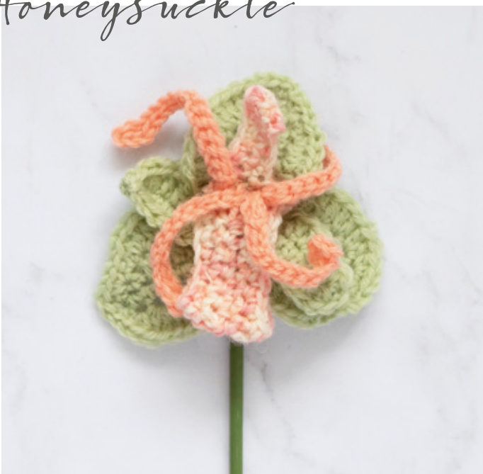
Crocheted in English Rose 806, Lisianthus 281 and Hydrangea 335