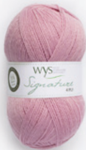
Sweet Pea 517